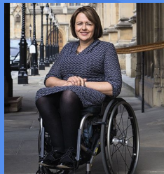
Tanni Grey-Thompson Champion of Disability Equality

Bevan House 381 Thompson House 381 Stephenson House 432 Pankhurst House 539