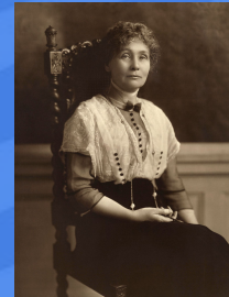
Emmeline Pankhurst Champion of Gender Equality