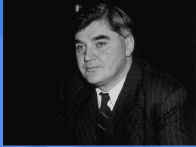
Nye Bevan Champion of Wealth Equality