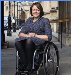
Tanni Grey-Thompson Champion of Disability Equality

Bevan House 494 Stephenson House 290 Pankhurst House 897 Thompson House 673